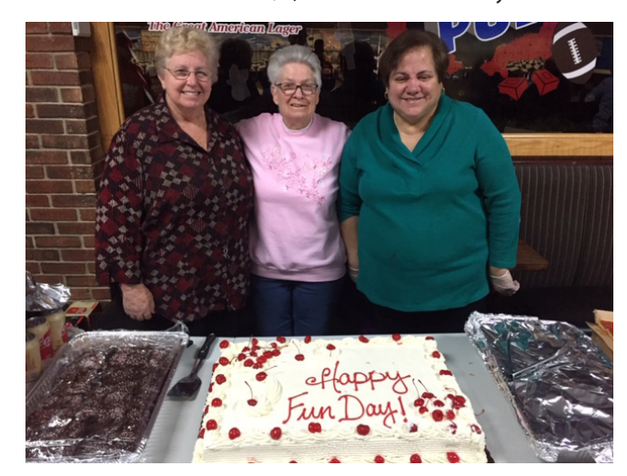
Good Times With Friends Christmas Fun Day.