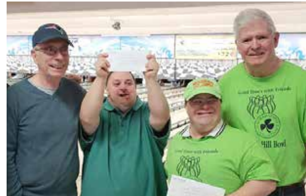
Good Times With Friends Bowling Winners